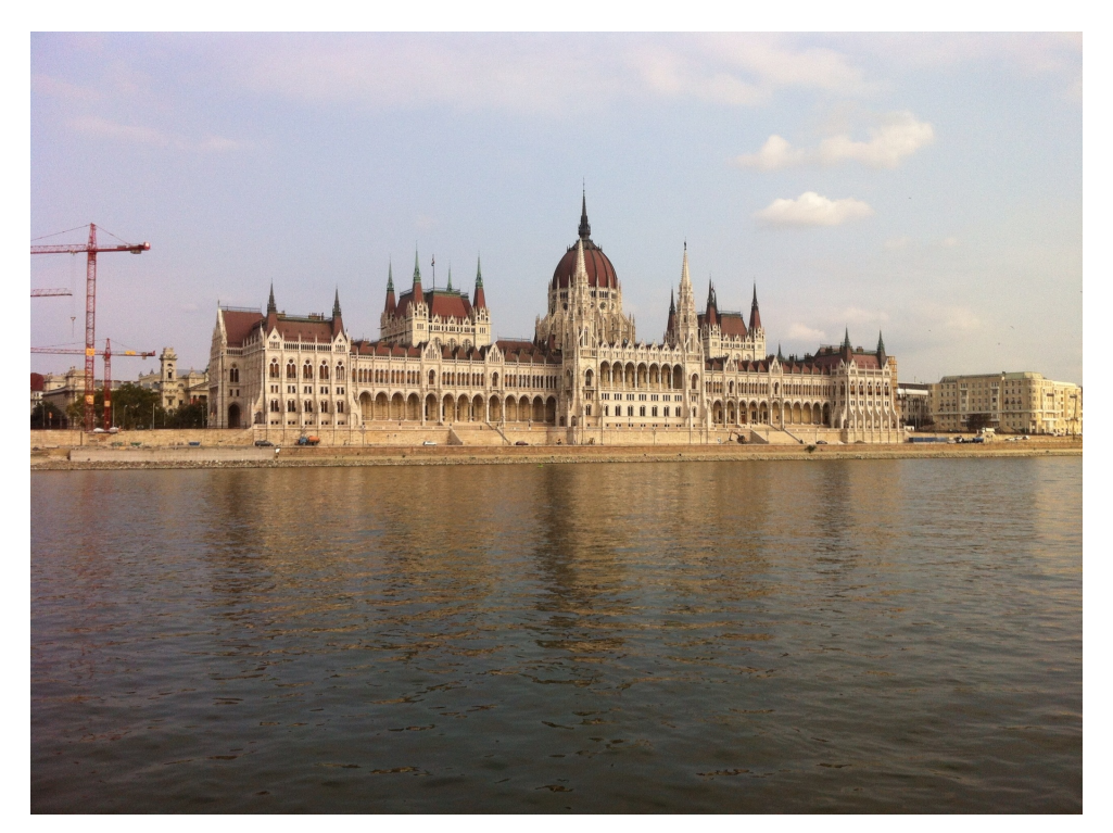
WEDNESDAY, 21 AUGUST 2013 19:43

Day 11. Today we did a city tour of Budapest on a hop on hop off bus. It was really worth it as we were shown all the main sites on both sides of the Danube with good audio commentary. This took a couple of hours to do the circuit but we were given opportunities to get down. Eventually we completed the circuit and got off at the end to visit the Hungarian House of Photography (located in Mai Mano House) which was well worth a visit. The entry ticket came to about 75p equivalent and the exhibitors were all Hungarian photography students part of the 'Present Continuous' project which aims to get Hungarian artists noticed around the world. The quality of the work exhibited was excellent, reminds me of the work I see at uni in England. The building itself dated back to the late 19th century and is very grand both inside and out. The Parisian detailing of the architecture makes it an ideal place to hold art exhibitions.